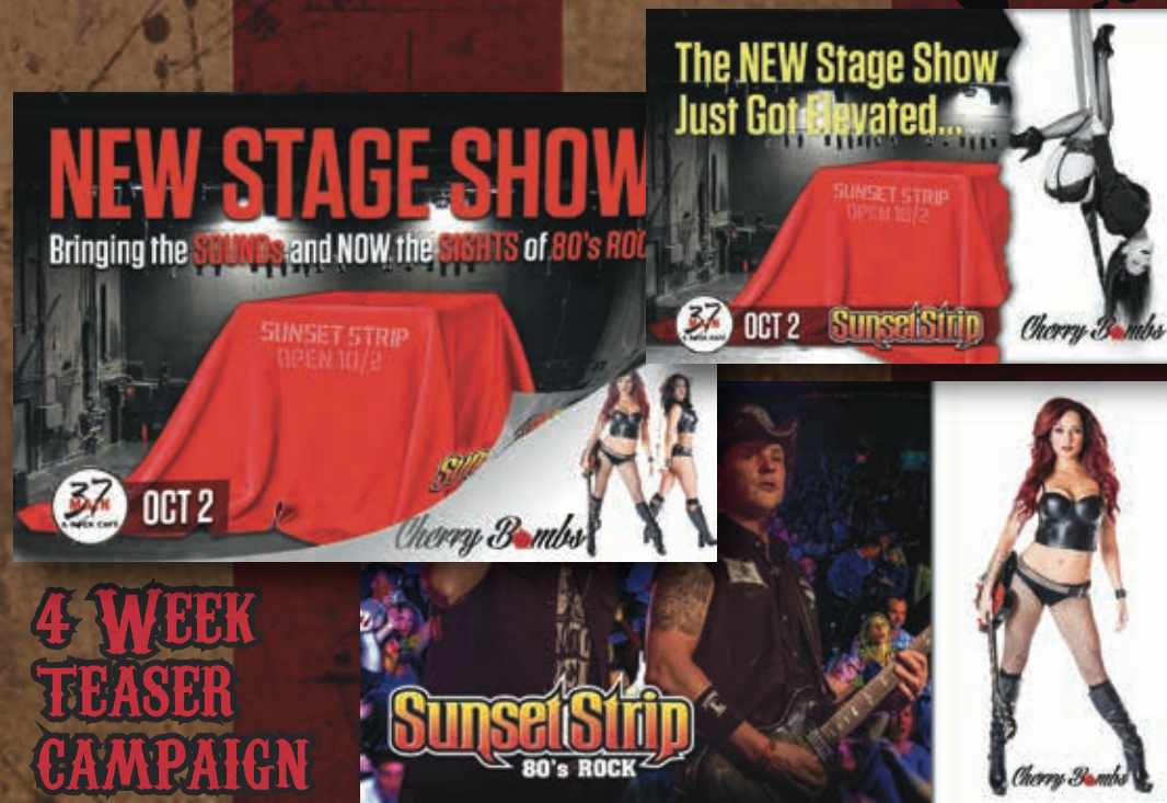
4 WEEK TEASER CAMPAIGN