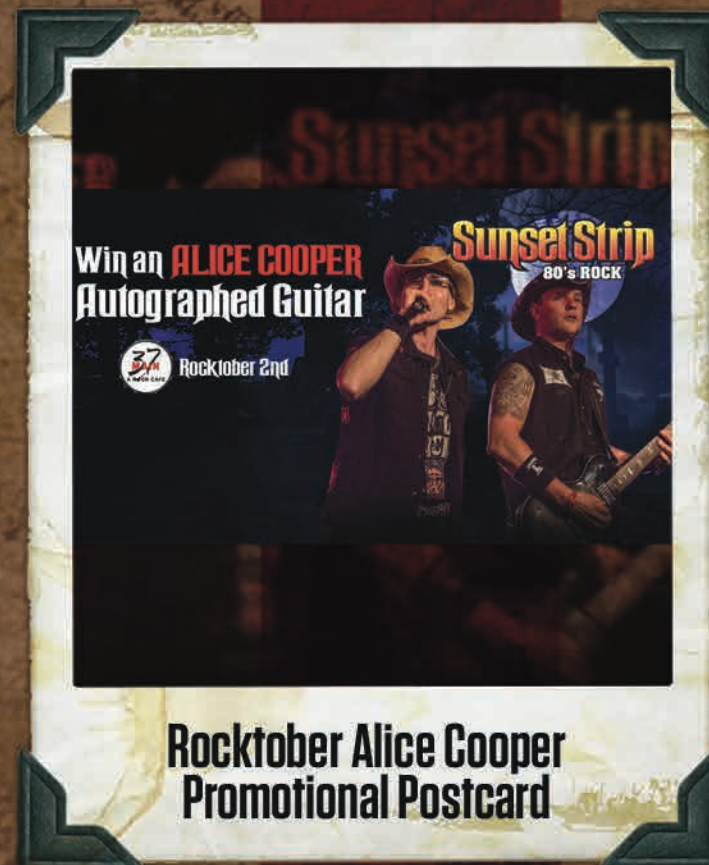
Rocktober Alice Cooper Promotional Postcard